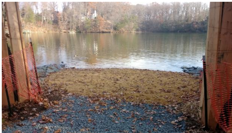
Just add kayaks: Improvements at the Homeport Farms launch include a blacktop and gravel path ending in a sandy put-in.

The improvements at Homeport Farm Park are almost completed and the park will reopen this spring. The old dirt access road now has a hard surface, the access path is blacktop and packed gravel instead of grass and bumpy roots, and the launch is a new sandy beach. The park also has an ingenious sod-topped parking lot and, most importantly, will finally get a portapotty. Homeport Farm Park website: http://www.aacounty.org/locations-and-directions/homeport-farm-park