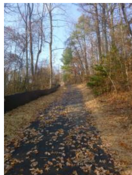
The blacktop path at Homeport Farms

The improvements to the launch onto the Bodkin from Downs Park are almost done. Launching onto the Bodkin from Downs used to require determination - the course included maneuvering a kayak down a hill following a deer path and getting stuck in sucking mud and hung up on green briar. No more. That muddy launch is now a wide sandy beach and the hill is an easy gentle slope. The access path is completely paved from