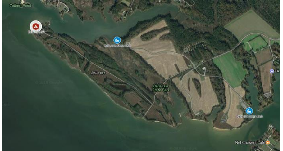
These launches put you onto the Rappahannock River or a tributary (Mulberry Creek) and you could paddle to the campsite for an overnight. The state park campground is one of the best in the state and makes a good base camp for paddling the lower Rappahannock area.

http://www.cpakayaker.com/chesapeake-bay-access-and-paddle-in-campsite-map/