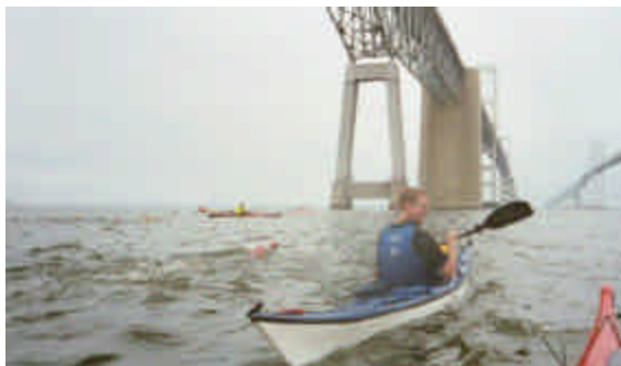
Kayak swim support

CPA provides kayak on-water support for charitable swim events and public sea kayak symposiums