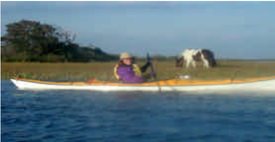
Paddling at Assateague Island

CPA members offer each other informal instruction in rescues, wet exits, rolling, and other safety skills. In spring and summer our Piracy evening paddles are a great way to learn skills. In winter, learn and practice skills at the Fairlands Aquatic Center in Prince George's County.