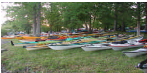
The "fleet" at SK-102, Lake Anna, VA

We offer workshops on topics such as sea kayaking for beginners, kayaking in cold water, sea kayak surfing, rescues, rolling, navigation, and trip leading skills. Our premier paddling skills weekend, SK-102, is held early each spring in the warm waters of Lake Anna, Virginia.