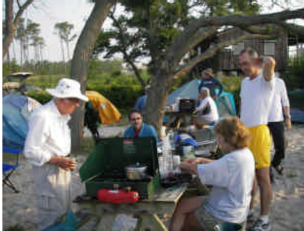
Camping at New Point Comfort, VA

Members organize and lead many kayak camping trips to places like Assateague and Janes Islands and other locations throughout the Chesapeake Bay area.