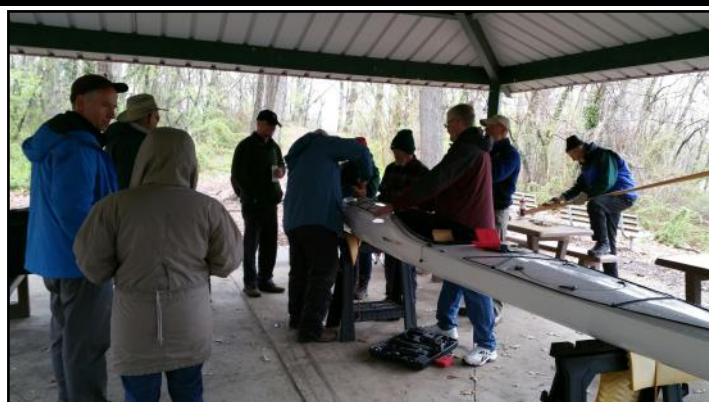
CPA Kayak Workshop