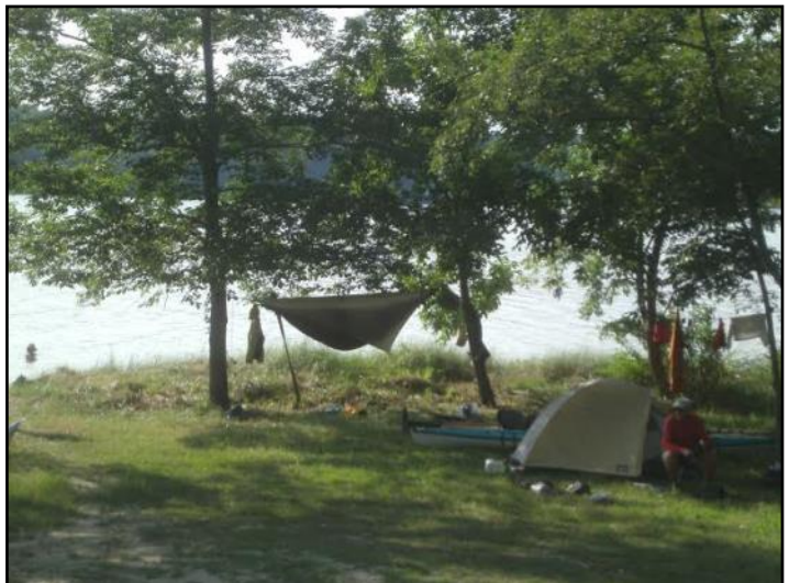
Kayak Camping at Chapel Point State Park, Maryland