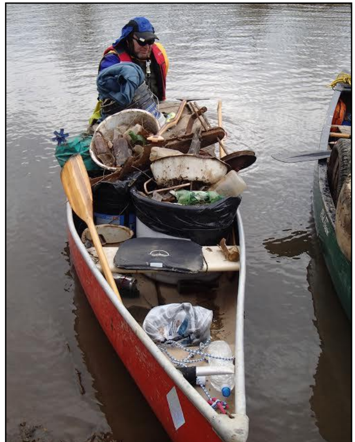
Quite a Load!