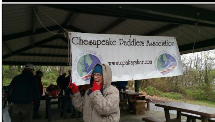
CPA Kayak Workshop