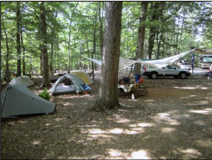
Kayak Car Camping at Pohick Bay Regional Park, Virginia