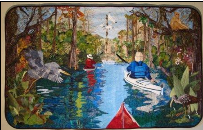
Silver River Serenity