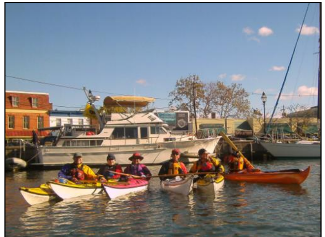
CPA Members at the 2013 Annual Meeting Paddle kayak Ego Alley in Annapolis, Maryland