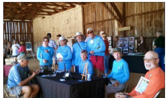
CPA members at the Newtowne Neck State Park Open House