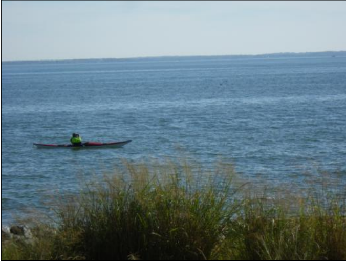
CPA Trip at the Newtowne Neck State Park Open House