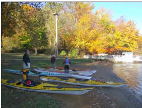
2013 CPA Annual Meeting Paddle, Truxtun Park, Annapolis, Maryland

Public service announcement and personal ads to sell kayaks/accessories are printed at no charge; non-members pay $10 for 3 months.