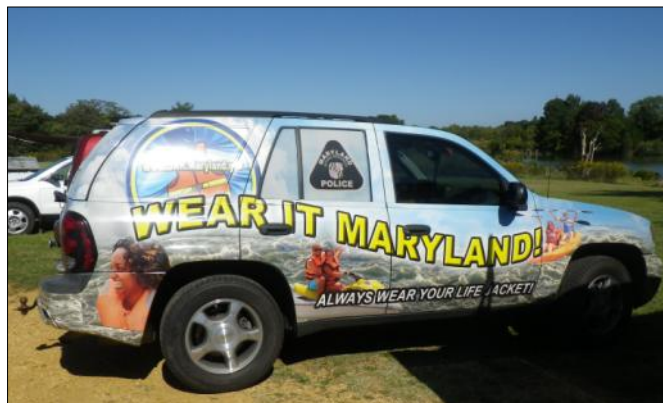
Always Wear Your Life Jacket, Newtowne Neck Open House