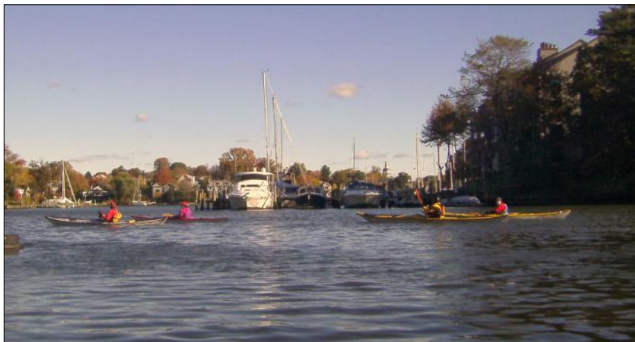
2013 Annual Meeting Paddle Annapolis, Maryland

Check the CPA website, the Pirates of Arundell's forum discussion for the location schedule for the remainder of the 2014 season: http://www.cpakayaker.com/forums/viewforum.php?f=10 .