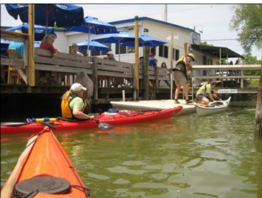
Happy Harbor in Deale, Maryland