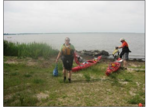
Sandy Beach Launch at Rose Haven, Anne Arundel County, Maryland

Happy Harbor Restaurant: http://www.happyharbordeale.com/