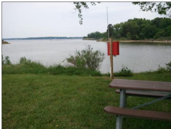
New Town Neck State Park, Launch onto Saint Nicholas Creek and Breton Bay

The planning committee is preparing for an open house on Saturday, September 27 from noon to 3 PM at the park to inform citizens of the opportunities and get their feedback on what activities people want to pursue on the property. I'll be organizing a demonstration at the kayak launch site with participants on the Point Lookout Camper to show people what we do, talk about what opportunities for paddling the park accommodates, and advocate for the vision of a camping water trail on the Potomac. Bring your kayak and join us, and fill out the questionnaire about what YOU want to do at New Towne Neck.