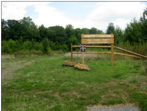
Homeport Farm Park Sign