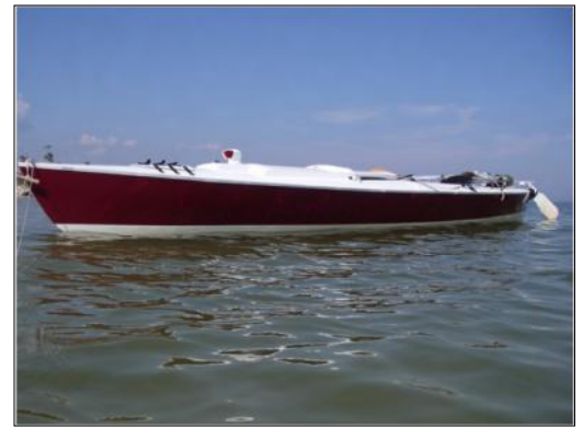
The Blue Skies Design, Patuxent Queen

In a burst of progress the bulkheads and deck were glassed to the hull, transforming the flexible hull and a garage full of floppy parts into a rigid structure. One last joint remained, glassing the inside hull to deck joint. This process involved saturating eight or ten foot long, 3 inch wide strips of fiberglass tape, rolling them up, bending over upside down inside the boat and rolling the mess out along the corner between the deck and hull and tamping it in place with a broom handle. This is the closest I've come to throwing up in the boat. The remainder of that summer was spent installing the boat's signature deck house/dorade box and performing the very unnatural act of cutting a slot in the bottom of the hull for the Hobie® Miragedrive®.