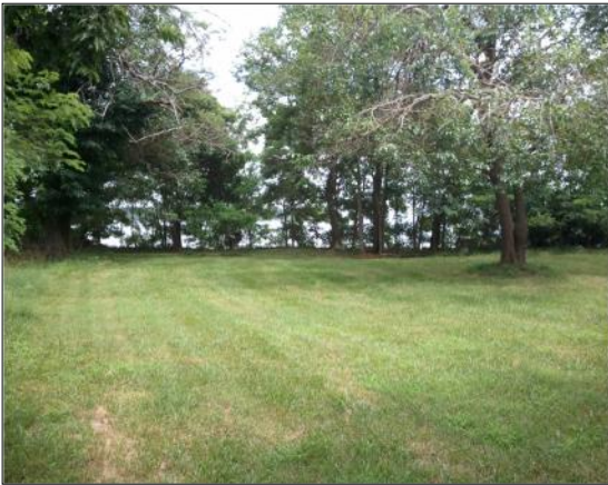
Potential Paddle-in Campsite Camping Area