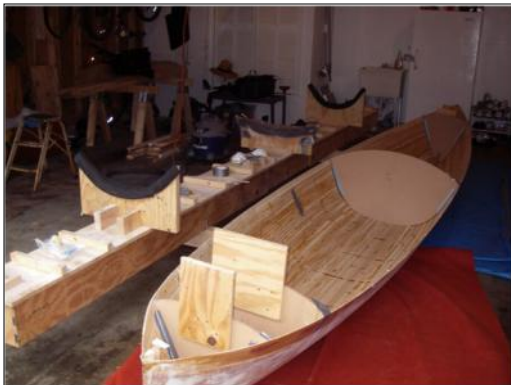
Right Side Up!

In preparation for the first of many...many sanding sessions, the staples (over 1,200 if you must know) were pulled. The cedar is quite soft, so a long board with 80 grit paper smoothed the hull in a couple of weekends. At this point I was quite pleased with the workmanship, until a drop light shown from inside the hull revealed multiple areas with gaps between the strips. Sigh. To ensure that the gaps and general porosity didn't absorb too much resin during subsequent fiberglassing steps, the hull was coated epoxy and the gaps filled with resin and filler. This set the stage for yet more sanding. The hull had to be smooth, with no rough spots that could snag the fiberglass cloth. Fiberglassing is one of those short duration "Hail Mary" building stages where everything has to work, and work quickly. The dry fabric is draped over the hull and epoxy resin is poured and quickly spread using a plastic scraper. Since fiberglass fibers are actually transparent, the cloth disappears with the application of resin. After the initial layer has cured, a second layer of resin is applied to fill in the weave and provide a (reasonably) smooth surface.