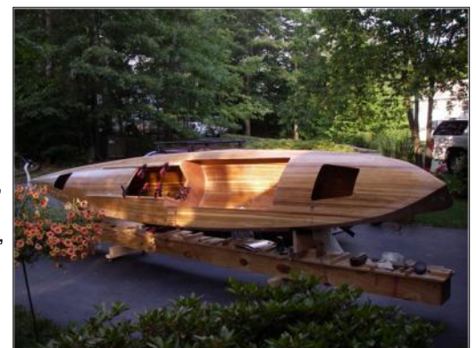
Deck Installed

Spring temperatures finally did arrive, allowing for the painting stage. I hate painting, probably because I'm lousy at it. Since the boat was expected to spend months at a time in the water, the lower hull was given three coats of anti-osmotic blister coating, followed by three layers (most of which were sanded off) of unloaded bottom paint. This may have been overkill, but the original Blue Skies had to be re-glassed about halfway through her Great Loop voyage due to water seeping into the wood core. I didn't want to be doing that mid-trip. The deck was given a couple of coats of semi-gloss mist gray and the middle hull a deep red. The initial build was complete.