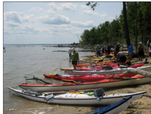
Columbia Beach at Franklin Point State Park