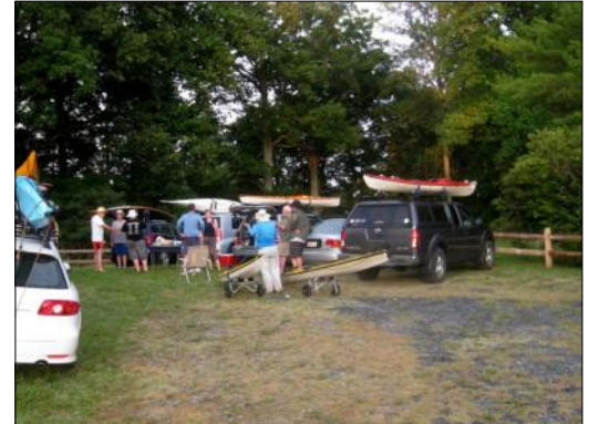
Pirates of Arundell's Potluck Picnic