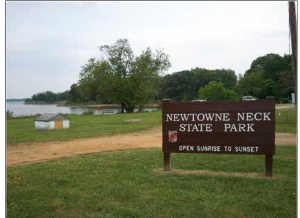
Launch at New Towne Neck State Park

Planning a new park is a complicated endeavor, with many interests demanding many things, often incompatible, from the land. Constraining these demands are the laws and regulations (Maryland's Chesapeake Bay Critical Area Protection Act, wetlands regulations, archeological heritage protection laws, threatened and endangered species laws and regulations, etc.) and very real physical limitations (wetlands, soil restrictions, potential sea level change, etc.). The planning process will likely take several years ( http://www.dnr.state.md.us/publiclands/pdfs/newtowneplan.pdf ), and implementing the plan will take even longer as funding for development is limited.