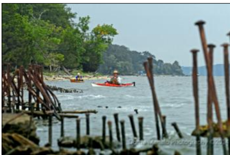
Kayaking along Caledon State Park, Virginia