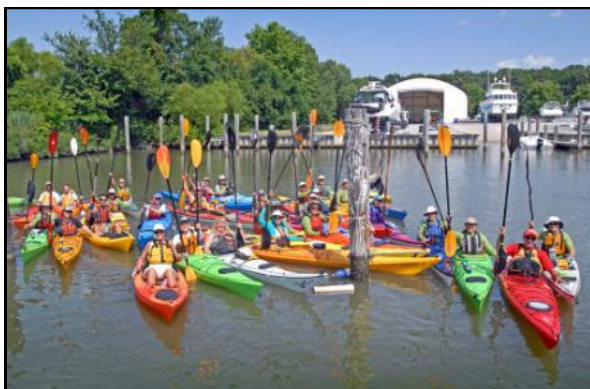
Kayakers at the Shady Side Ribbon Cutting

Chesapeake Kayak Adventures: http://www.meetup.com/Chesapeake-Kayak-Adventures/