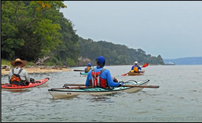
Kayaking along the Potomac River shoreline from Caledon State Park, Virginia, which just opened a new kayak-in campsite