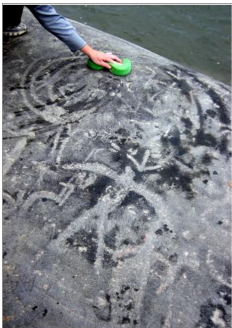
Petroglyphs located along Lake Aldred, a portion of the Susquehanna River near Holtwood, Pa.

In mid-October, 20 paddlers from the Pirates of Baltimore (PoB), Pirates of the North (PoN), and Pirates of the Lakes (PoL) met to paddle to the Indian petroglyphs of Lake Aldred. The literal translation of "petroglyph" is "carvings in rock." Petroglyphs are the symbolized tales of people, animals, and events of ancient times, forever preserved in nature's most enduring tablet. The Lake Aldred petroglyphs are among the last to be found in eastern North America.