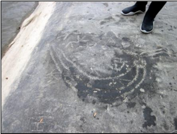
Petroglyphs along Lake Aldred