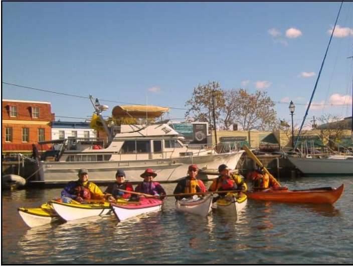
CPA Members Kayak Ego Alley before the 2013 Annual Meeting in Annapolis, Maryland