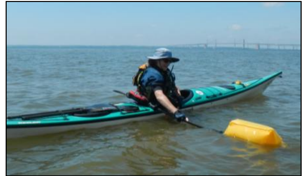
Rotate towards the paddle float, keeping your weight on the paddle shaft