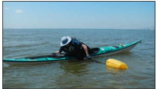
Keep your weight shifted toward the paddle float as you work your legs into the cockpit