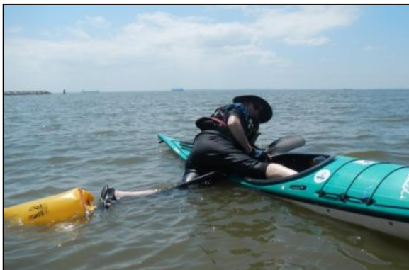
Move the leg closest to the bow into the cockpit