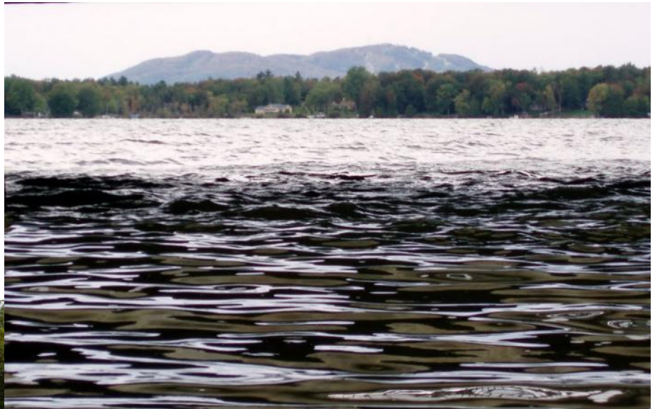
Lac Brome from the Marsh

We kayaked in five different bodies of water. We all arrived on Sunday and on Monday AM it was raining, so we traveled to the Abbaye Saint-Benoit where we heard the monks singing Gregorian chants (also purchasing some excellent blue cheese) and then on to Lake Memphremagog in Quebec for a late morning and afternoon paddle on quite calm water. It was still raining lightly but that was fine. Lots of lily pads and birds. Tuesday we traveled to Lake Brome, Quebec, and experienced a little wave action (the only agitated water we experienced). We kayaked about half a mile in the open lake and entered the Brome Marsh, which was mostly winding channels.