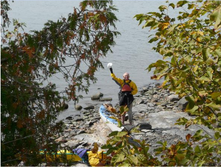
Lake Champlain