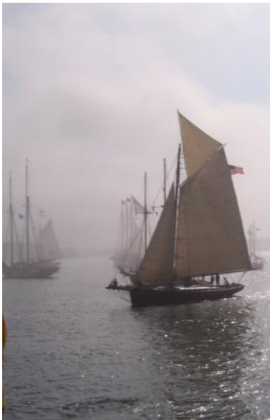
The 50 foot Gaff Sloop Vela comes to anchor as the fog lifts Brooklyn, Me

A 5% discount will be given for ads supplied as electronic files in acceptable formats (i.e. .tif, .gif, .jpeg, bit-map). Email or call for more information and for 10-month discount. See advertising contact in masthead.