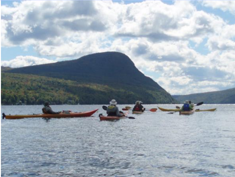
Lake Willoughby, Canada