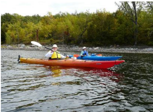
Lake Champlain

After lunch we paddled across the lake to a Tiki bar and had a late afternoon drink. That is where I learned about "loonies" and "toonies" (after I used the strange looking coin as a tip only to learn it was worth two dollars). Wednesday we moved on to Lake Willoughby, Vermont, which looked like a fjord. We paddled in the morning, and in the afternoon practiced strokes and I and several others did wet exits and rescues (the water was quite warm). Thursday we went to Lake Champlain, in Vermont, where the waters in both my trips there were extremely calm. Friday morning we