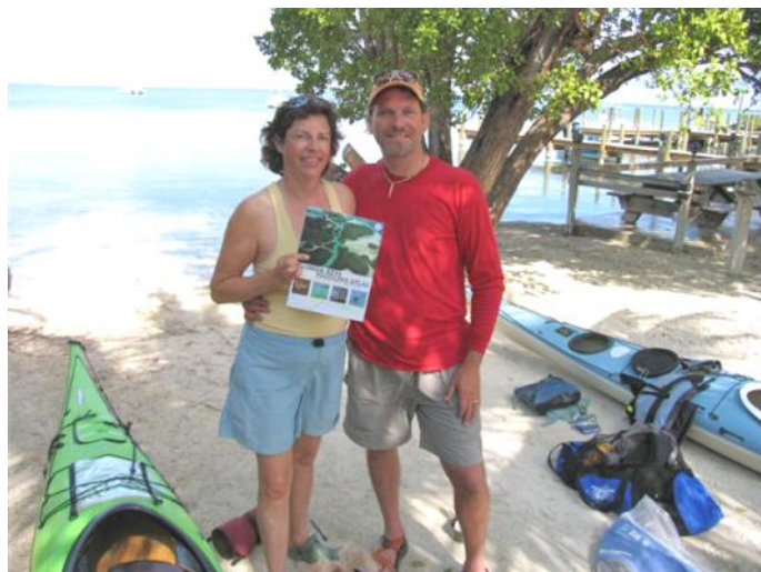
Burnhams preparing for 100-mile trip