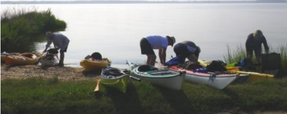
Getting ready