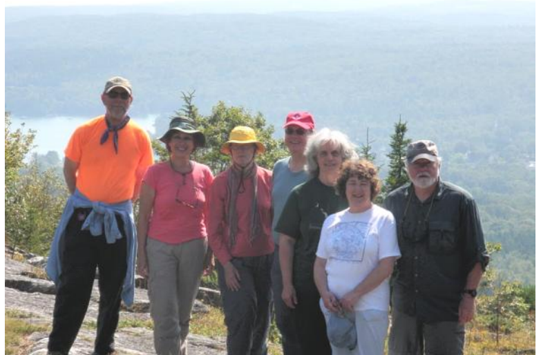
On Blue Hill's summit