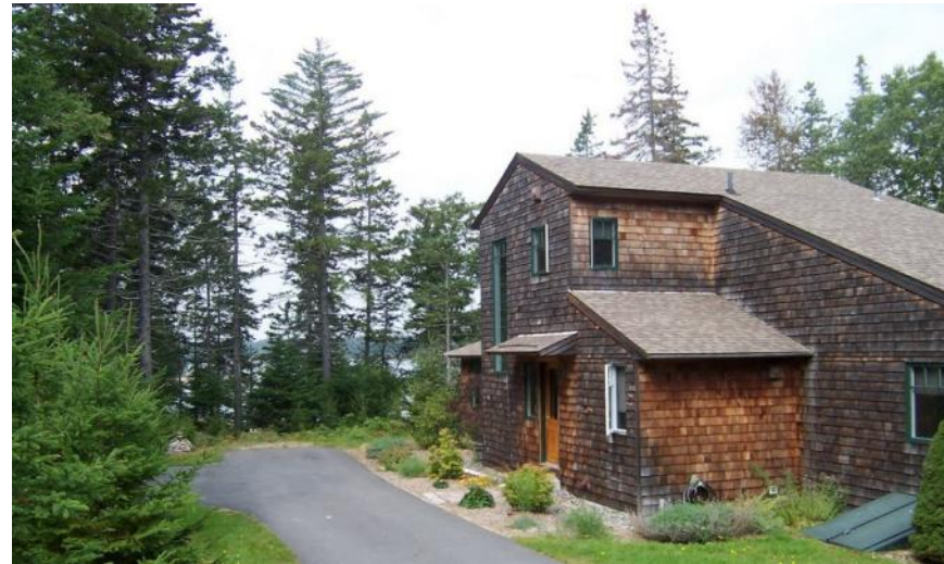
Our "camp" in Maine

September is one of the best times of the year to visit the Maine coast. Several kinds of pests are gone, including blackflies and school-age children, but the water is as warm as it ever gets, and the weather is usually pretty mild. The bustle at the height of the tourist season is over, but there is still a lot going on.