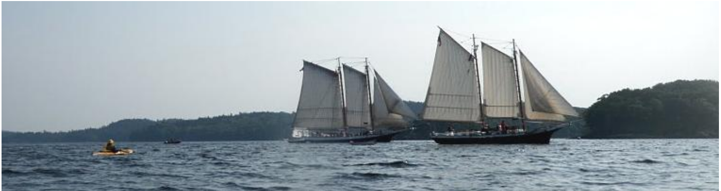
Two Windjammers in Smith Cove, near Castine

sailed from WBS to Castine, and landed on the east side of Holbrook for lunch, having the entire island to ourselves. After lunch, we paddled out to Castine again, coasting along the waterfront and posing at the stern of the State of Maine, the Maine Maritime Academy's training vessel, before returning to Smith Cove. Just as we entered the cove, two graceful schooners tacked about in tandem and crossed in front of us under sail, a thrilling sight.