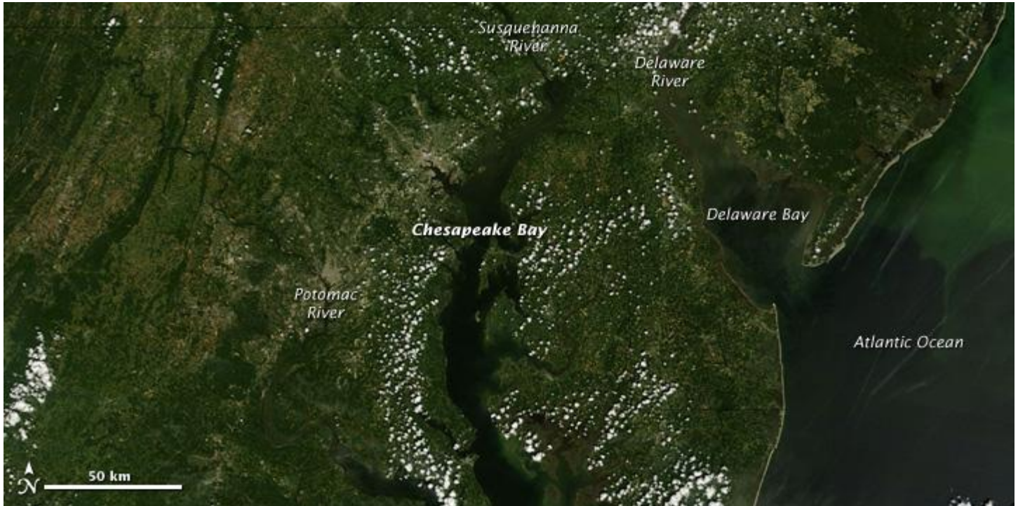
August 23, 2011

Below are some interesting pictures of the Chesapeake Bay taken by NASA's Terra satellite before and after Tropical Storm Lee. According to NASA only two other events have carried more fresh water into the Bay; Tropical Storm Agnes in 1972 and a snowmelt event in 1996. Source link is: http://earthobservatory.nasa.gov/IOTD/view.php?id=52169