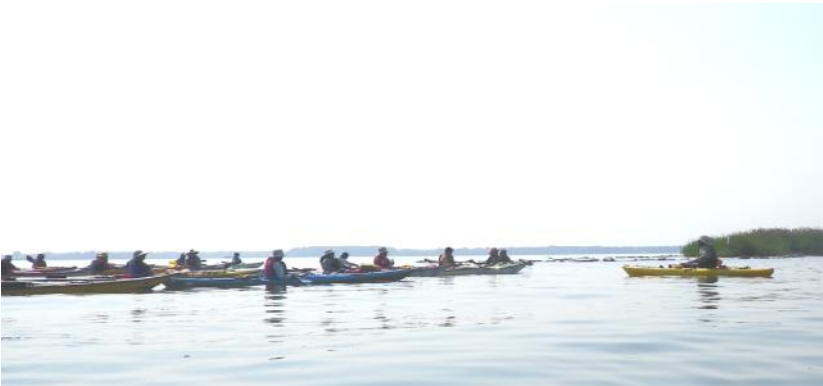
Interpretation of Hail Creek restoration photo by Colby Hawkinson, USFWS