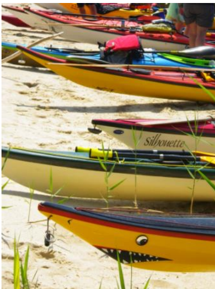
Boats on shore for lunch at ENWR

A 5% discount will be given for ads supplied as electronic files in acceptable formats (i.e. .tif, .gif, .jpeg, bit-map). Email or call for more information and for 10-month discount. See advertising contact in masthead.