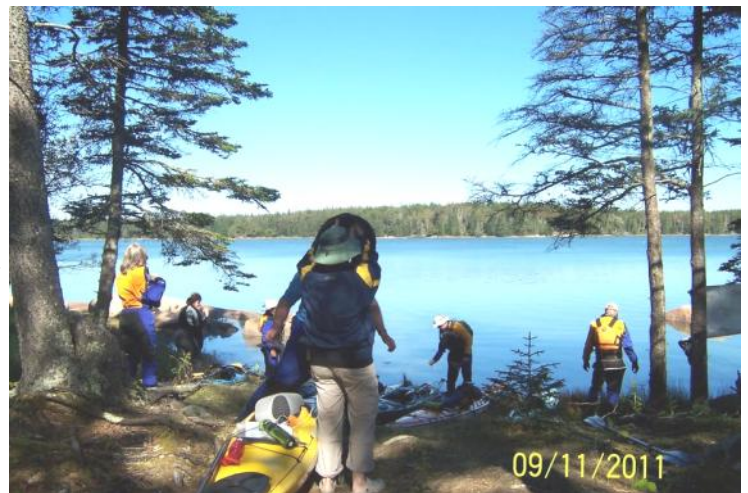
Launch from the rocks on Greenlaw Cove