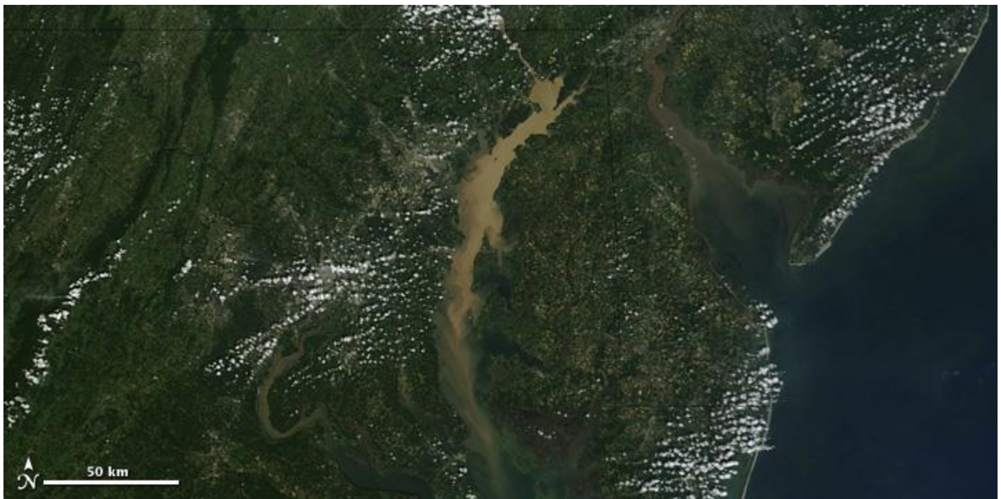
September 13, 2011