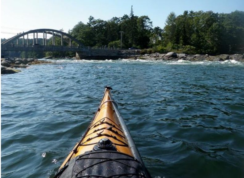
8.5 knot (9.8 mph) current in the reversing falls

Although we understood what a 10 foot tide difference meant cerebrally, we were still surprised when we cut across the back channel between islands and ran out of water! The last ten feet required towing our boats through sticky mud to get to what remained of the channel, then a slog over muddy flats to get back to the rocks where we had launched in the morning. Tidal awareness was now thoroughly ingrained, along with the slate-gray mud ingrained in our paddling gear.