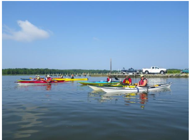
Heading out

Program participants commented that one of the highlights of the day was stopping on the Chester River side of the refuge near Hail Cove to learn about the Living Shoreline restoration project underway there. They enjoyed an interpretive talk about the restoration and then paddled around Hail Point and all the way up Hail Creek to view the project area from the water on the 'back' side. The paddlers appreciated getting to learn about the Hail Cove Restoration Project while viewing it from both sides. They said this gave them a better appreciation for how ecologically important (and thin) that strip of land is. Eastern Neck National Wildlife Refuge thanks the Chesapeake Paddlers Association for this opportunity to educate visitors to the refuge out on the water and hopes to plan similar events in the future.