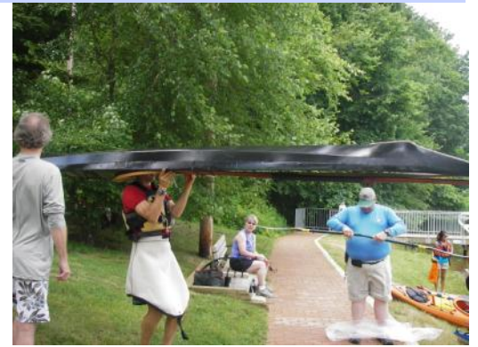
Nice Greenland-style hat

We are three weeks away from our Fourth Annual Gear Day to be held again this year at Truxtun Park, Annapolis, on Sunday, June 26 (10 AM to 3 PM). The same pavilion we had before has been reserved. Meet and drop off your gear at the large pavilion, which is just up the hill from the boat ramp. Then park your car in the lots further back by the restrooms. We'll spread out on the picnic tables and in the grass next to the pavilion. One area will be reserved for shop-and-swap, and another for food.