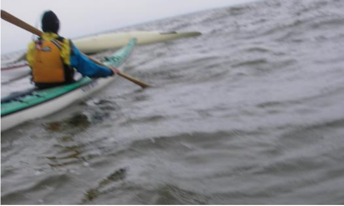
Practicing rescues under "real time" conditions at SK203