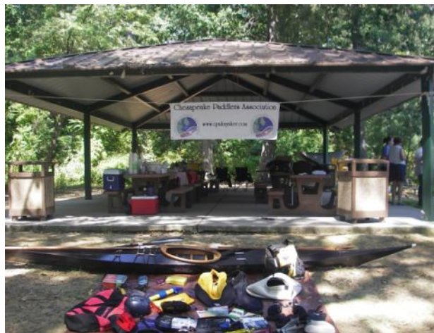
The Pavilion at Truxtun Park, First Annual CPA Gear Day

It's a short walk to the beach, perfect for launching and trying kayaks. PLEASE AVOID THE BOAT RAMP: We don't want to hinder other park visitors who are launching boats from trailers, or get in their way on the water.