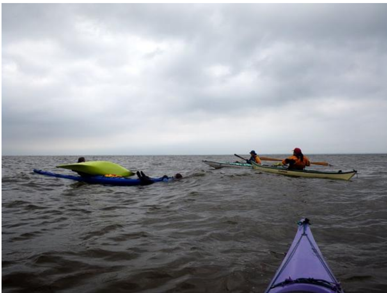
Practicing for when your luck runs out

Since then, I've learned a lot and have led a lot of CPA trips myself, never having benefited from a formal course like SK203. I'd like to think that my spotless record leading trips (Nobody died!) was due to the sum of experiences as a Boy Scout, Naval Officer, and a large portion of mother wit and common sense. I'd like to think it, but it isn't true—just lucky again. All the training and rescue practice at SK102, the Piracies and SK203 is just to make sure that on that awful day when my (and other trip leaders' luck runs out, we have something more substantial to fall back on.