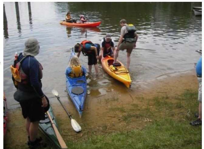
Launching students for “Fall –Out-Of-Your Boat”

This is a great time to practice your wet exit and re-entry as well as learning some fundamental group rescues. For those that are new to the sport, you will learn how to perform a wet exit and a re-entry into your kayak. You will be required to have a spray skirt, bilge pump, paddle float and of course your PFD. A CPA waiver (see http://www.cpkayaker.com/uploads/resources/CPARelease.pdf ) is required for all on-water activities. Fill it out at home and bring it.