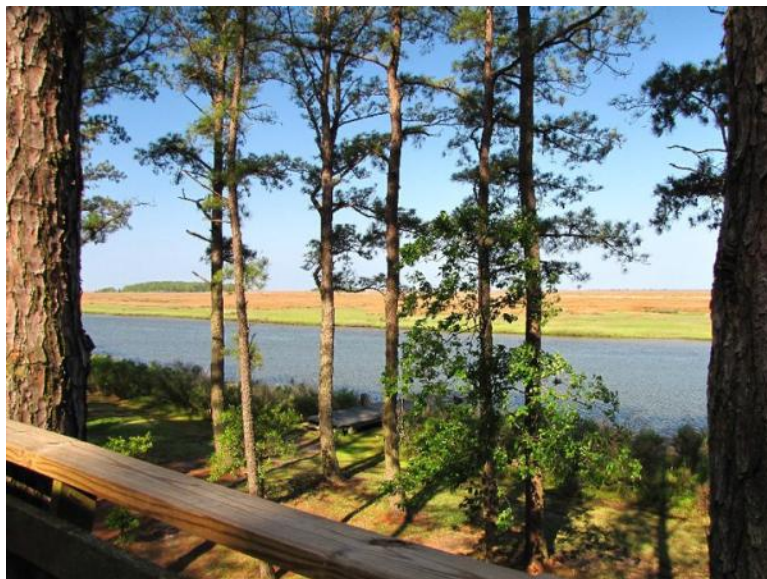
Janes Island from the State Park area

Janes Island has a kayak dock and a boat launch. The launch is normally reserved for powerboats, but because we had such a large crowd coming, the park rangers told us we could use it. That was helpful when the rest of the paddlers arrived; launching fourteen boats would take a long time using a single kayak dock (although the kayak dock is really convenient and easy to use). There is also a rack for guests' boats, so we didn't have to load and unload every day – very convenient. We said we didn't have locks for the boats and a park employee said, "Don't worry about it. People around here are too lazy to steal." Throughout our stay, the park personnel went out of their way to make our stay enjoyable, and they achieved their goal. We felt welcome.