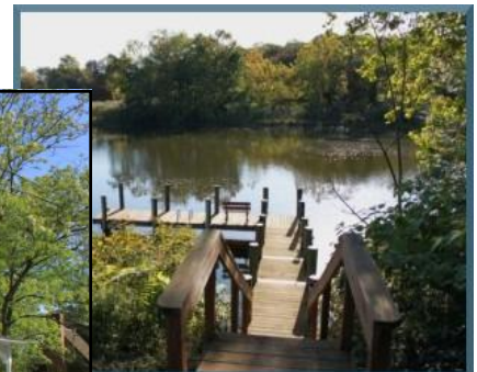
Beth B&B's Boat Dock