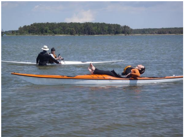
Rocking and Rolling at Janes Island