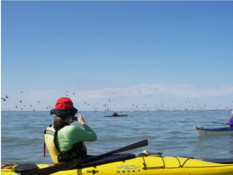
Pelican swarm at Smith Island's South Point Marsh