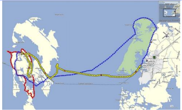
Yellow track: Friday 17.6 Mi. Red Track: Saturday 11.8 Mi. Blue Track: Sunday 21.4 Mi GPS track by Rich Stevens

We decided to break into two groups, one going on to cross over to Tangier Island, and the other group completing the clockwise circumnavigation around Smith Island. Ralph, Gina, Laurie, and I headed up the west coast to Rhodes Point, admiring the many birds along the way. We noticed a long line of power lines over the water that ended where Shanks Island used to be. Paddling on to Rhodes Point, we took the Doctor's Gut through the marsh to Ewell. We stopped at Ruke's and had crab cake sandwiches. Ralph opted for the whole crab (soft shell). He called it a Bug Sandwich! Yum. I tried one last year and it was delicious. We encountered Rich Stevens and Steven Jahnke from the "other" Pirate band and checked out their quaint little lodgings in a converted crab shack.