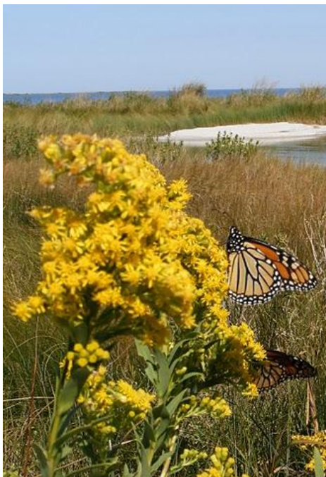
Monarch on Goldenrod, Smith Island

A 5% discount will be given for ads supplied as electronic files in acceptable formats (i.e. .tif, .gif, .jpeg, bit-map). Email or call for more information and for 10-month discount. See advertising contact in masthead.