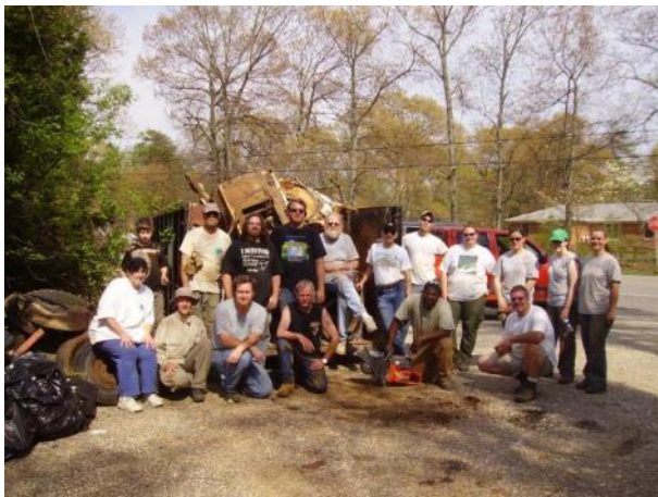
Pax River trash and trashers in 2009