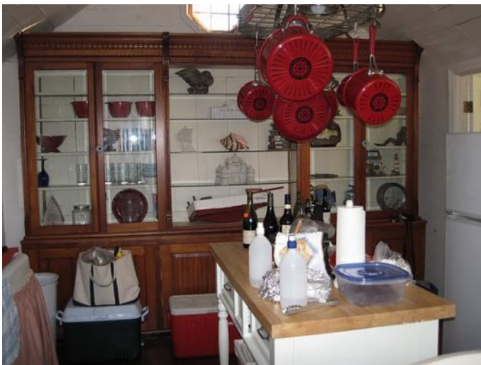
The cottage on Ewell