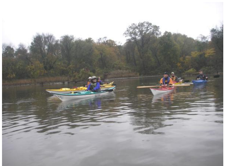
Last year on the Anacostia