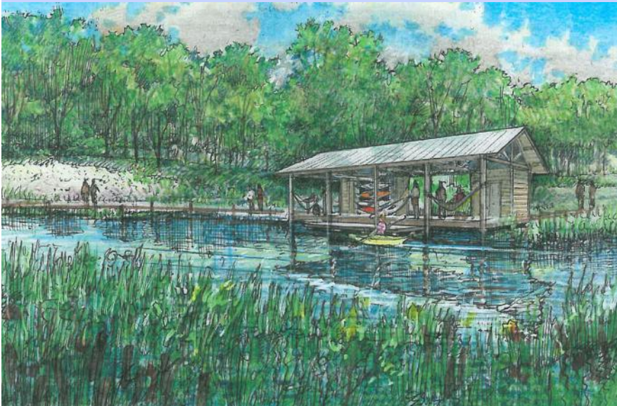
Artistic view of kayak/canoe platform and hammockry on Catfish Hole, Battle Creek from Biscoe Gray Heritage Farm Draft Plan