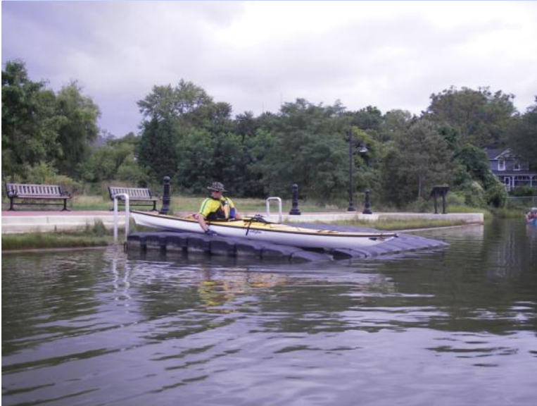
New Kayak Launch at Leonardtown Wharf