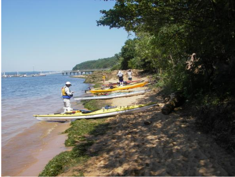
New canoe and kayak launching beach at Elk Neck's Northeast Beach