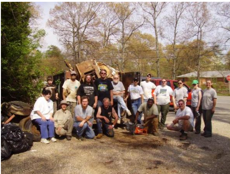
Pax River trash and trashers in 2009