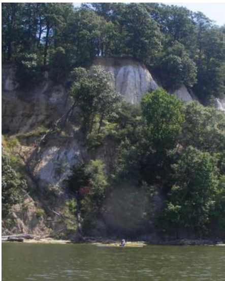
Cliffs above Turkey Point, Elk Neck, MD

A 5% discount will be given for ads supplied as electronic files in acceptable formats (i.e. .tif, .gif, .jpeg, bit-map). Email or call for more information and for 10-month discount. See advertising contact in masthead.