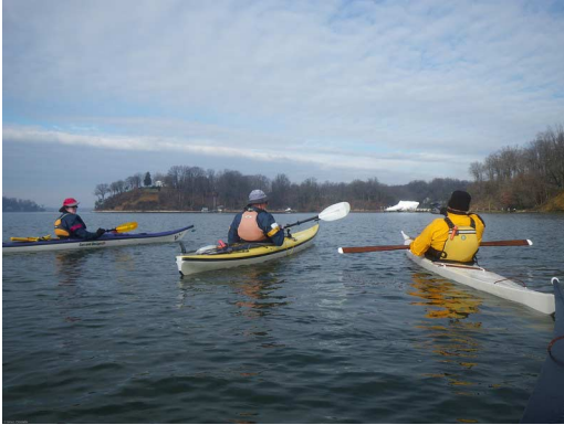
Paddlers on the Severn, New Year's Day

A 5% discount will be given for ads supplied as electronic files in acceptable formats (i.e. .tif, .gif, .jpeg, bit-map). Email or call for more information and for 10-month discount. See advertising contact in masthead.