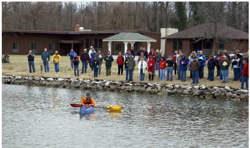
On-Water Demos