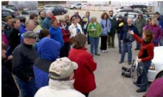
Rack, Boats, Paddles, Gear and more

Chesapeake Paddlers Association, Inc. CPA is a completely volunteer-run organization. The mission of the Chesapeake Paddlers Association is to promote safe sea kayaking and safe paddling practices through the education of the local sea kayaking community and the interested public. Club activities consistent with this mission may include, but are not limited to, instructional kayak trips, instructional kayak camping trips, instructional workshops, and any other activities consistent with the mission that members of the club wish to organize.