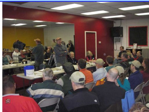
2009 Annual Meeting

and has been approved by the Steering Committee. Both the Steering Committee and the Bylaws Subcommittee ask that you vote to approve the amended bylaws. You can attend the meeting, or mail the ballot on page 8 to be received prior to February 6.