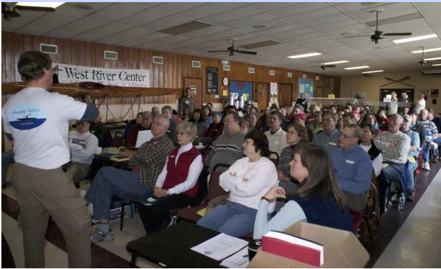
Classroom instruction