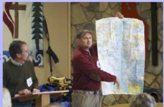
Places to paddle

Cancellations: Please be sure to contact Gina if you know you won't be able to attend so that someone on the waiting list can benefit.