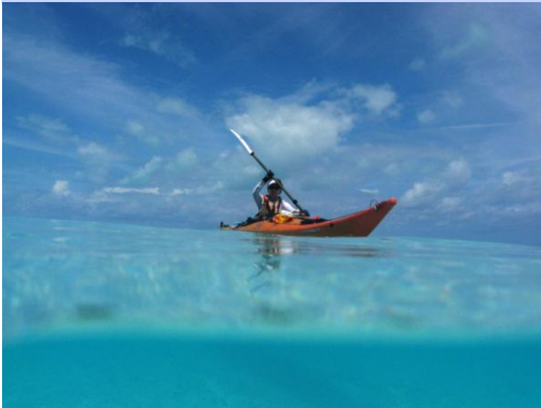
From the 2012 Calendar—January, Barre Terre, Great Exuma Island, Bahamas