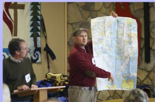
Places to paddle

Cancellations: No refunds will be issued for cancellations received after March 2, 2012. Please be sure to contact us if you know you won't be able to attend so that someone on the waiting list can benefit.