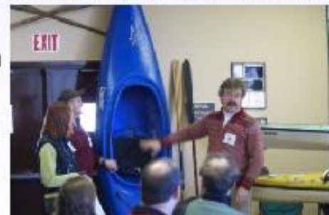
Comparison of kayak types