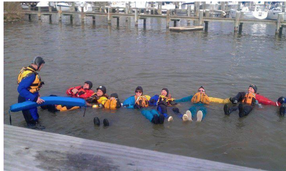
Cold water paddlers and gear put to the test

Increase your chance of survival at the start of a cold water paddle by dressing