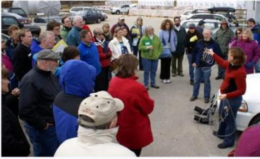
Rack, Boats, Paddles, Gear and more