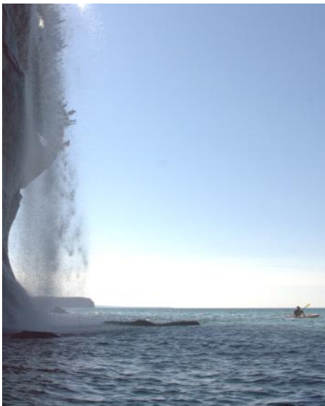
From the 2012 Calendar—May, Pictured Rocks National Lakeshore, Lake Superior, Michigan

A 5% discount will be given for ads supplied as electronic files in acceptable formats (i.e. .tif, .gif, .jpeg, bit-map). Email or call for more information and for 10-month discount. See advertising contact in masthead.