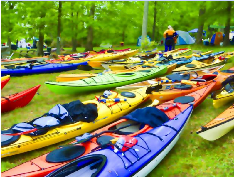
A kayaker's dream, Lake Anna