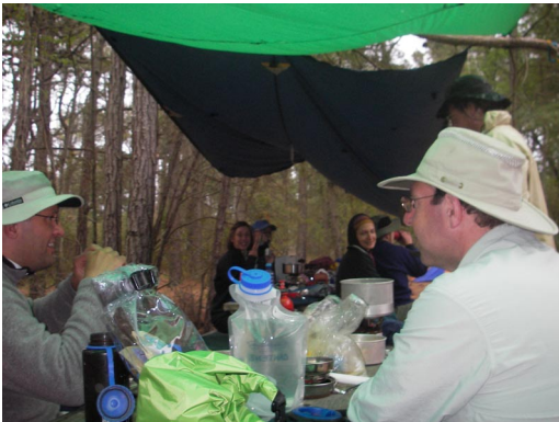
Oysters on Assateague Island

Want a leisurely day paddle? Here is what is planned. A little adventure can be had at Eastern Neck Island on May 17th . Another challenging day paddler for those ready for some Chesapeake Adventure to Thomas Point Lighthouse on May 10th . On May 24th you can paddle and Celebrate History at Chestertown, MD. And don't forget the Piracy Opener Paddles which will be announced during the month of April on the CPA Forums. So far, we have