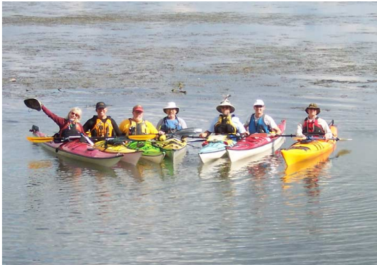
Sunday Paddlers, Elk Neck 2006