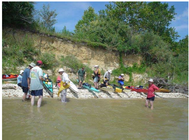
Nanjemoy Trip