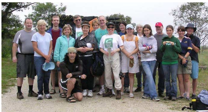
Terrapin Nature Area Cleanup

Read about Chip's ferry adventure and canoeing the Whanganui River on the CPA Forum under Trip Reports http://www.cpakayaker.com/forums/viewtopic.php?t=1659