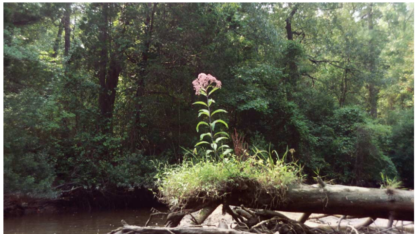
Joe Pye Weed out on a limb