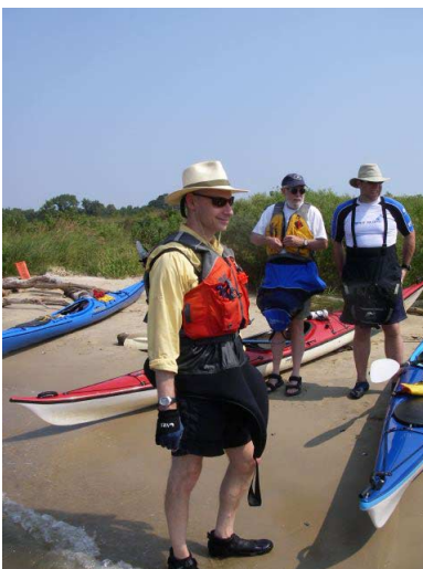
Eastern Neck Trek