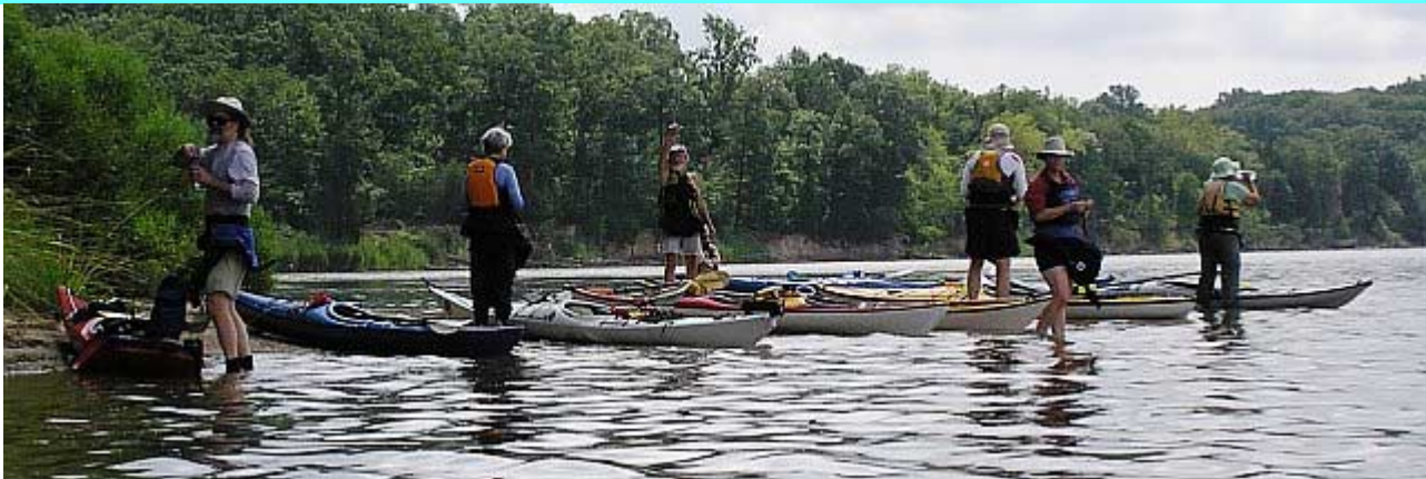
Nanjemoy Creek/ Port Tobacco Paddle

April 27-29—The Ninth Annual SK102 Skills Clinic (on water), Lake Anna, VA