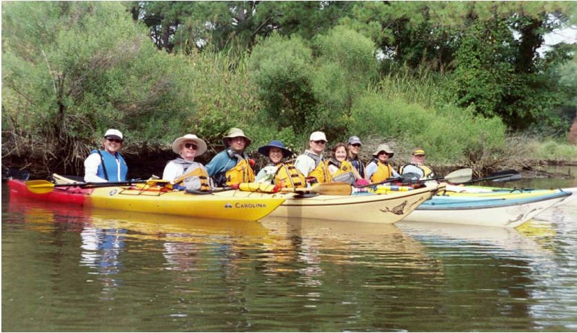
Group shot awaiting a muskrat

We set out around 9:30 AM from the end of Camp Calvert Road, located behind Ryken Catholic High School. The launch site's shallow depth supports only canoes and kayaks. Oyster shells located everywhere on the beach motivated some folks to launch directly out in the water. Bill Gallagher reminded all of us to verify that the spray skirt "ripcord" was visible in case we needed a wet exit.