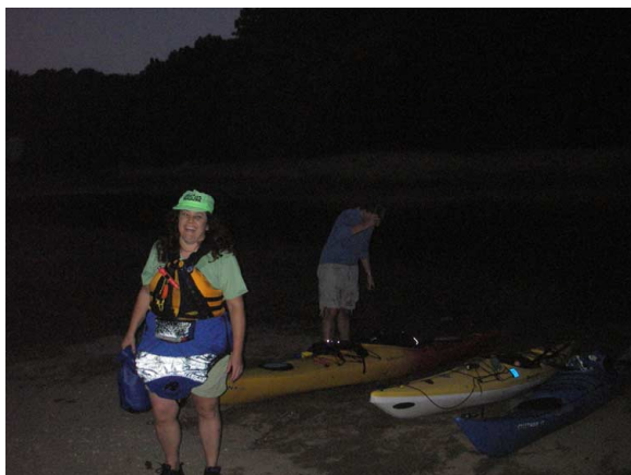
Sugarloafers at Rocky Gorge in the Dark

The Chesapeake Paddler Chesapeake Paddlers Association PO Box 341 Greenbelt, MD 20768