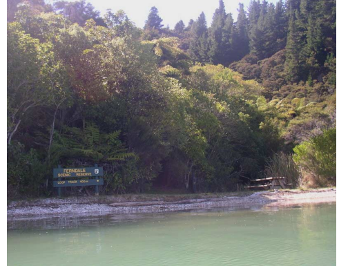
Camp at Ferndale.

I relaunched the kayak into Torea Bay and felt the wind beginning to pick up as I got onto Queen Charlotte Sound. The crossing was uneventful, amid mild whitecaps. I hugged the eastern shore as I paddled in Picton Bay, skirting close by the rocky shoreline, admiring the bottom formations in water with visibility to about ten feet. The tide completely covered the beach where I had launched on two days before, and I paddled right up to the seawall that lined the submerged beach. Conveniently, there was a wheel chair ramp where I was able to beach the kayak and get it up onto the cart for the haul over to the InterIslander Terminal.