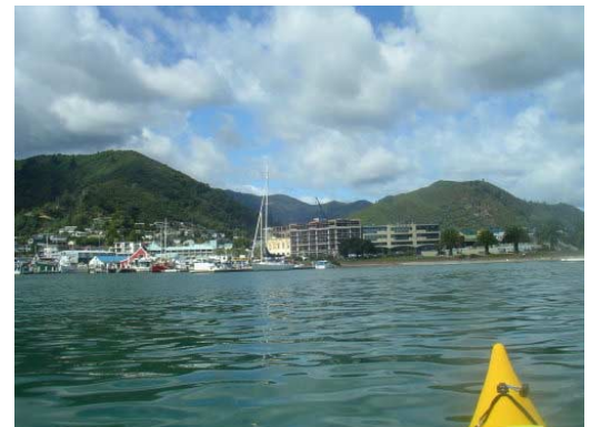
The Bluebridge took me to Picton.

In the small harborside town of Picton, I rolled my kayak off the ship and over to the Visitor Information Center. At the VIC, I bought a 2-night camping permit and correlated my map to the location of the DOC campsites. At the Subway (very popular in NZ) across the street I got a 12-inch sub and an energy sports drink and proceeded to the town beach in the center of town. Ate half the sub, stowed the rest, between 5 and 6pm, I launched. Surveying the Sound from the Ferry, I had become cautiously optimistic that conditions were improving as we came to the end of the sound. Sitting up in a large ship, it had been difficult to judge just how rough it was, but I decided to head out there and see. I figured I should be able to cross the sound in under two hours, so I'd have time to spare before dark, and I had marking lights if I needed them, and an alternative camp identified that was downwind, in case I had no choice but to head in that direction.