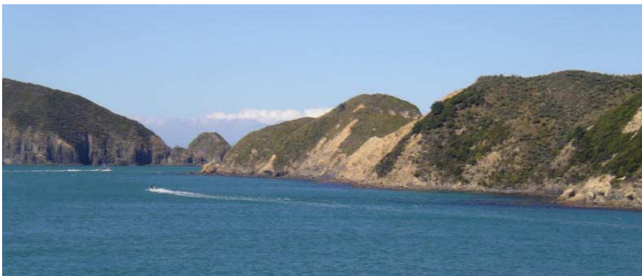
Queen Charlotte Sound.

[Editor's Note: Paddling away from home is always an adventure. This issue has a report on paddling away from home that came my way earlier this year.]