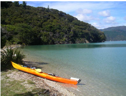
The Shear Water kayak at rest on the beach at Ferndale camp site.

I was booked on the 1:15pm, InterIslander ferry back to Wellington. I must say I enjoyed the nonconformity of walking through the terminal with a kayak in tow, and then getting in line with the cars, 18-wheelers, and RVs and walking the kayak up the ramp onto the Ferry. In a display of Kiwi humor, when asked where to leave the kayak one of the InterIslander staff pointed to the stairwell and told me to take it up to the 7th deck. She had me going for a second.