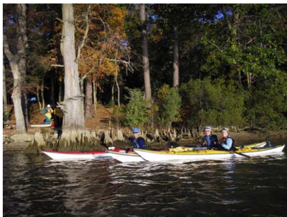
Chickahominy Paddle