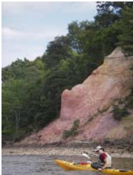
Dan Hoke at Red Point, Northeast River

Public service announcement and personal ads to sell kayaks/accessories are printed at no charge; non-members pay $10 for 3 months.