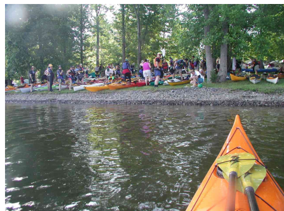
2004 SK102 class

Opera: http://www.opera.com An alternative web browser. The latest version of the Opera email client includes an RSS reader. (Win, Mac, Unix, OS/2; $39)