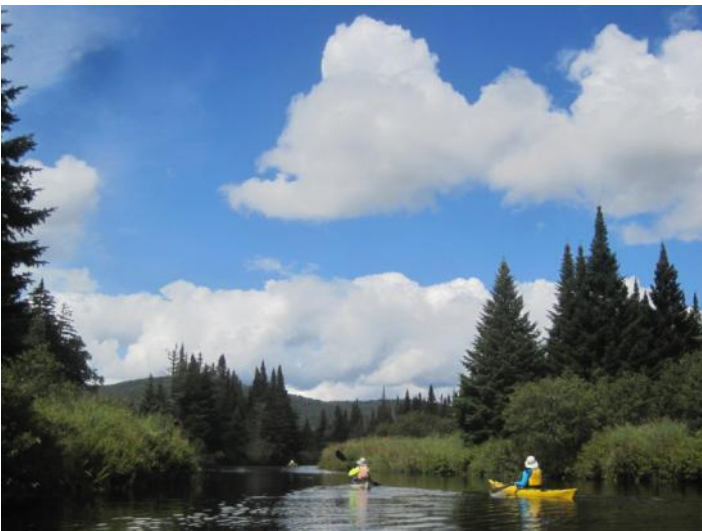
Mountain views on the Cedar River Flow

Starting out on the lake formed by the dam, we see mountains surrounding the lake, giving perspective as well as a scenic backdrop, and equally scenic islands, creating an interesting paddle path. The CPA Loons check out the avian loons and vice versa. We saw an adult with a juvenile riding on back as they do earlier in the summer. It struck me as getting rather late in the season for the young one to be at that stage of development. It's going to have to be able to fly in about a month, or it will miss the last flight out, as it were.